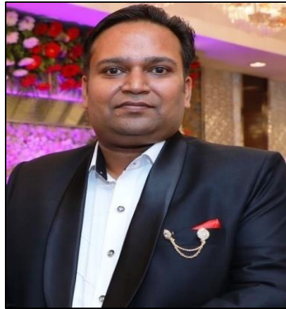
Secretary / Vice Chairman